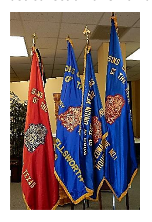
The Colors: Departmental and Camps #1, 2, and 18