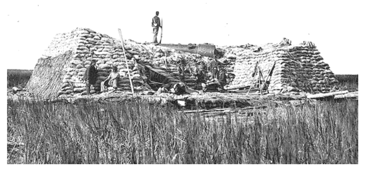
The Swamp Angel after it exploded!

On the thirty-sixth discharge, the entire breach, just behind the vent, blew out, and the gun was thrown forward on the parapet. The band which always encases the first re-enforce of Parrott guns, was split, and became entirely separated from the piece.