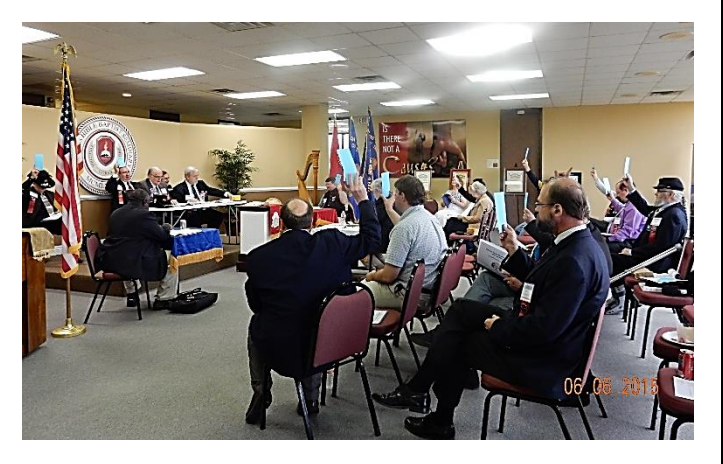
Attendees raise ballots to vote "Aye" to carry a motion