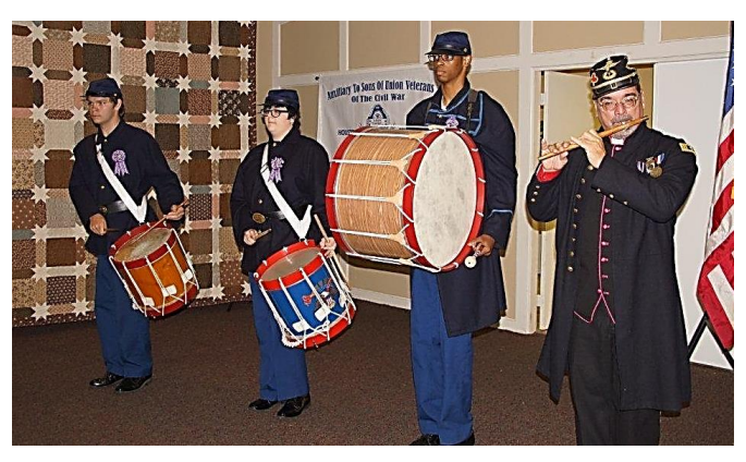
Ball High School JROTC Drum & Fife unit