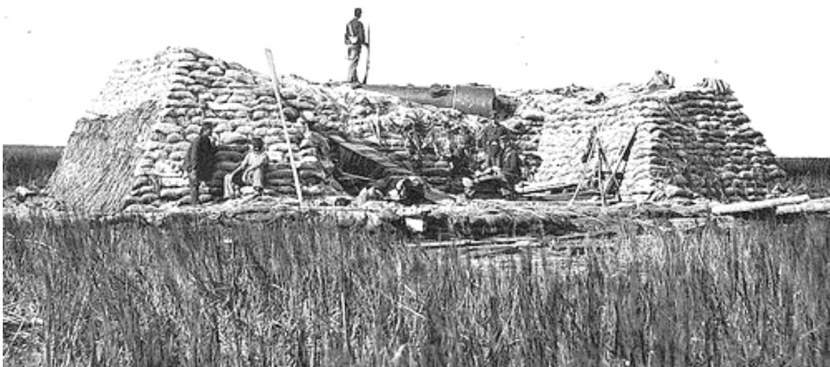
The Swamp Angel after it exploded!

On the thirty-sixth discharge, the entire breach, just behind the vent, blew out, and the gun was thrown forward on the parapet. The band which always encases the first re-enforce of Parrott guns, was split, and became entirely separated from the piece.