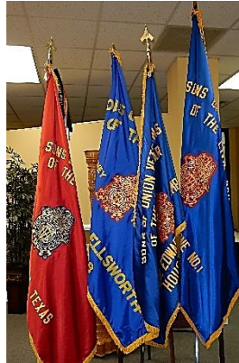
The Colors: Departmental and Camps #1, 2, and 18