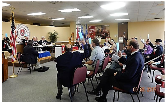
Attendees raise ballots to vote "Aye" to carry a motion