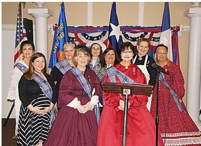
Ladies of the Sarah Emma Seelye Auxiliary