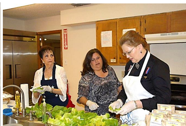
The real work went on behind the scenes