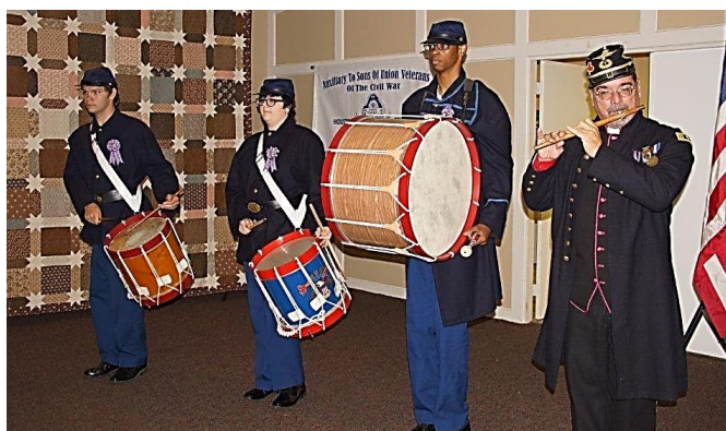
Ball High School JROTC Drum & Fife unit