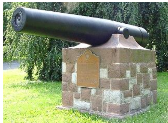
"The Swamp Angel" Cadwallader Park, Trenton, N.J.