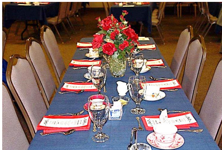
Elegant table settings