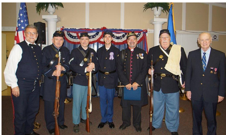
Lt. Edward Lea Camp #2 SUVCW Honor Guard