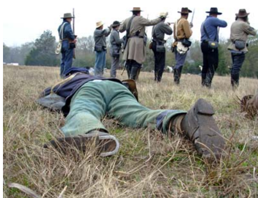
Left: A Rebel officer expertly commands his line of infantry as it advances forward through Federal casualties.