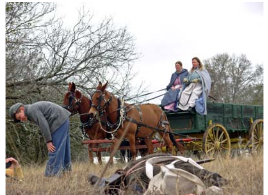
Right: Two women driving a mule-drawn wagon assist with the grim task of recovering casualties after the battle.