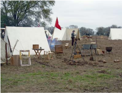
Left: A lone soldier stirs in a seemingly deserted campsite.