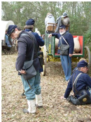
Left: Union soldiers and wagons mill about waiting for the call to form-up for action. Several take the opportunity to rest their feet!