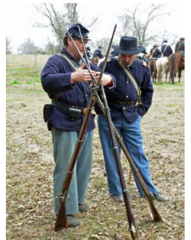
Right: A Federal officer listens intently behind stacked arms as a Private offers a suggestion. In the background, a line of Union Cavalry anxiously waits for orders to advance.